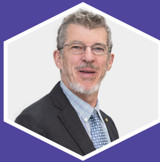
Prof. Ian Frazer Professor, Faculty of Medicine, UQ AC, FRS, FAA